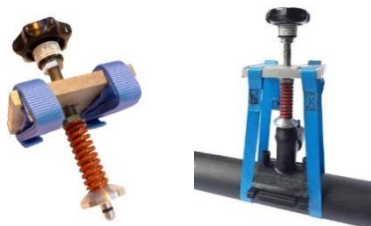
Top Load Clamp