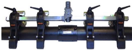
Straight with Knuckle Joint