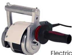
Electrical Saddle Scraper