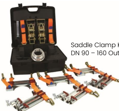
Saddle Clamp Kit DN 90 - 160 Outlets