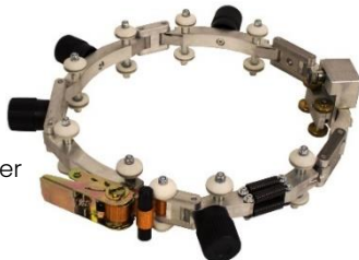
Rotational Chain Scraper