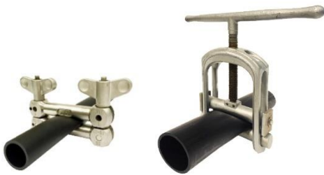
Manual Squeeze Off

Other sizes and Internal bead removal tools available on special request