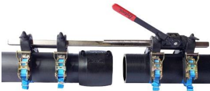
Straight with Ratchet runner