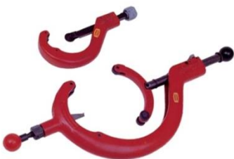
Quick Release Cutter