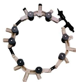
Rotational Pipe Cutter