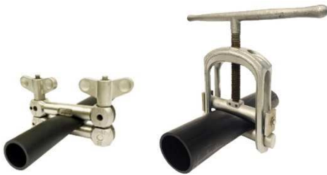
Manual Squeeze Off

Other sizes and Internal bead removal tools available on special request