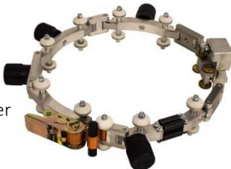
Rotational Chain Scraper