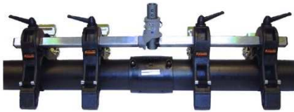
Straight with Knuckle Joint