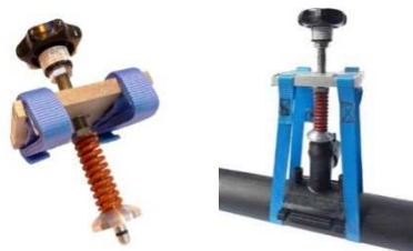
Top Load Clamp