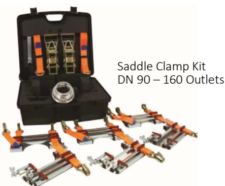
Saddle Clamp Kit DN 90 – 160 Outlets