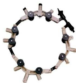
Rotational Pipe Cutter