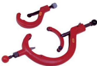
Quick Release Cutter