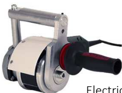
Electrical Saddle Scraper