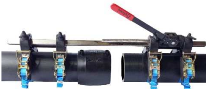
Straight with Ratchet runner